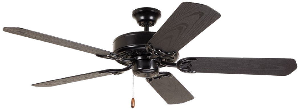
C. Shown in Barbeque Black with Barbeque Black Blades