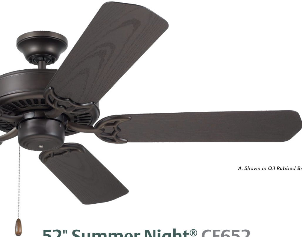
A. Shown in Oil Rubbed Bronze with Weather-Resistant Oil Rubbed Bronze Blades