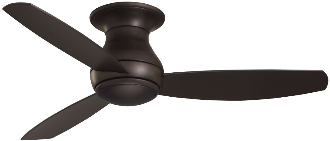
C. Shown in Oil Rubbed Bronze with Weather-Resistant Oil Rubbed Bronze Blades and No-Light Option