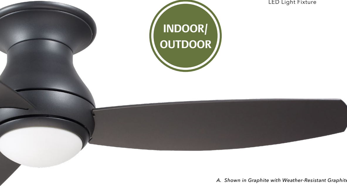
A. Shown in Graphite with Weather-Resistant Graphite Blades and Opal Matte Glass Shade