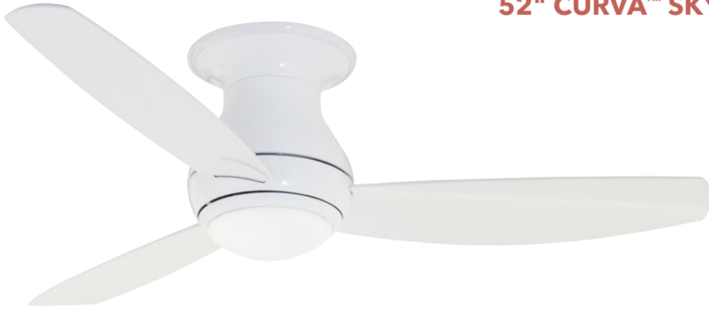
B. Shown in Appliance White with Weather-Resistant Appliance White Blades and Opal Matte Glass Shade