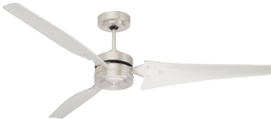
B. Shown in Brushed Steel with Brushed Steel Blades