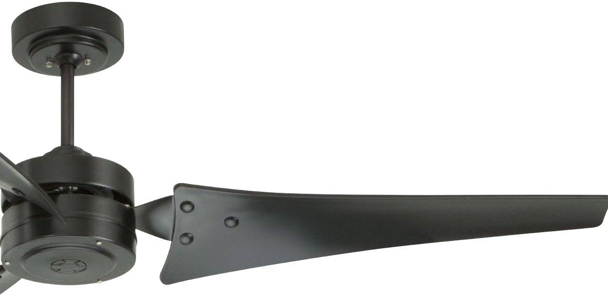
A. Shown in Barbeque Black with Weather-Resistant Barbeque Black Blades