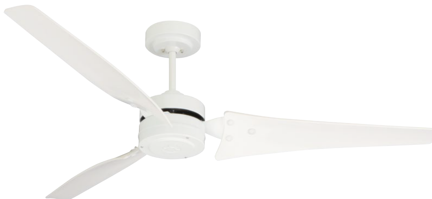
C. Shown in Appliance White with Weather-Resistant Appliance White Blades