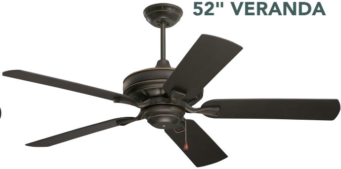
C. Shown in Golden Espresso with Weather-Resistant Chocolate Blades