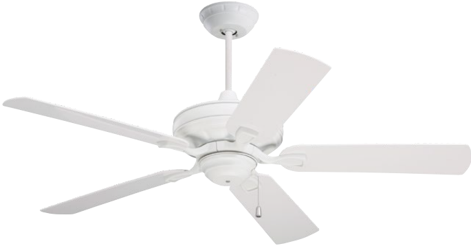
D. Shown in Satin White with Weather-Resistant Satin White Blades

A. 52" VERANDA – VINTAGE STEEL CF552VS - Weather-Resistant Chocolate Blades