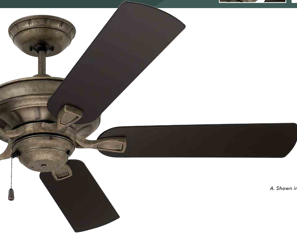
A. Shown in Vintage Steel with Weather-Resistant Chocolate Blades