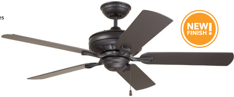
E. Shown in Graphite with Graphite Blades

E. 52" VERANDA – GRAPHITE NEW! CF552GRT - Graphite Blades