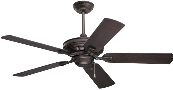
B. Shown in Oil Rubbed Bronze with Weather-Resistant Oil Rubbed Bronze Blades