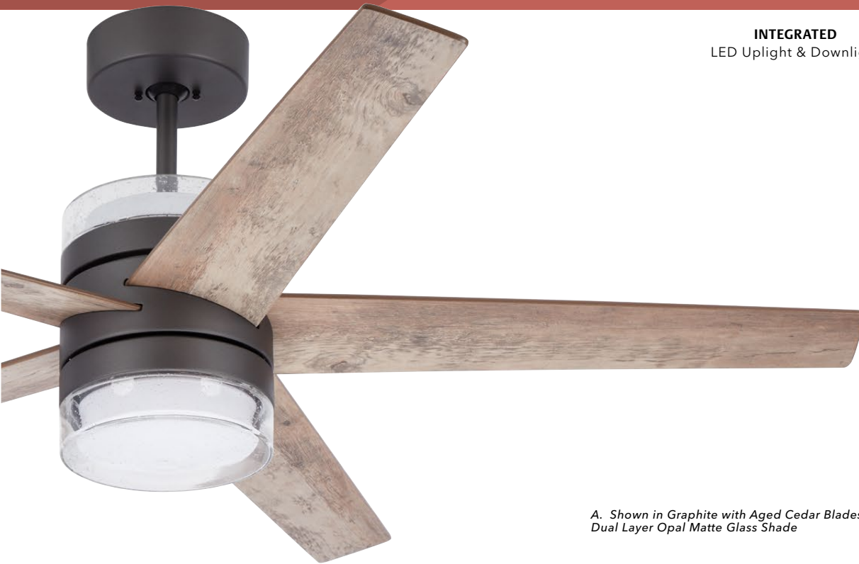
A. Shown in Graphite with Aged Cedar Blades and Dual Layer Opal Matte Glass Shade