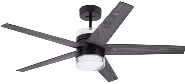
B. Shown in Barbeque Black with Charcoal Blades and Dual Layer Opal Matte Glass Shade