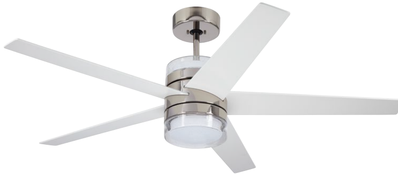
C. Shown in Polished Nickel with Satin White Blades and Dual Layer Opal Matte Glass Shade