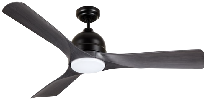
C. Shown in Barbeque Black with Weather-Resistant Charcoal Blades and Opal Matte Shade