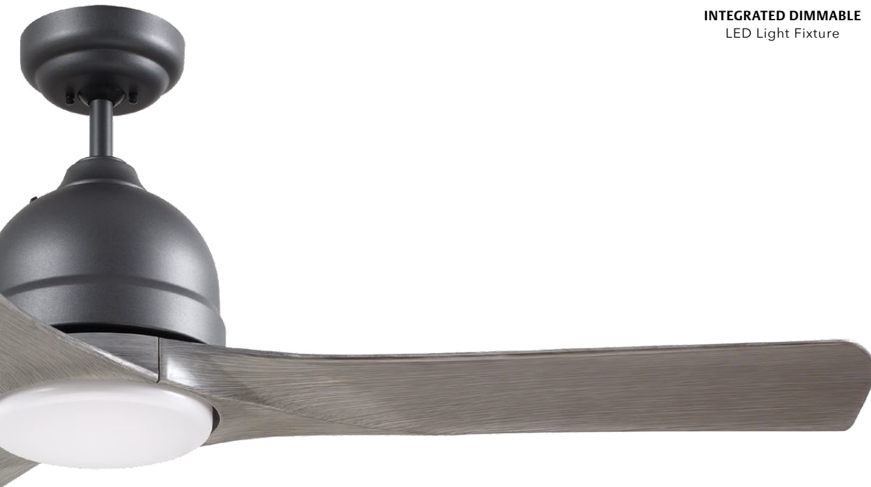
A. Shown in Graphite with Weather-Resistant Driftwood Blades and Opal Matte Shade