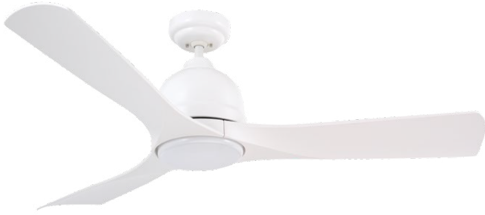
B. Shown in Satin White with Weather-Resistant Satin White Blades and Opal Matte Shade