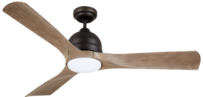
C. Shown in Oil Rubbed Bronze with Weather-Resistant Aged Oak Blades and Opal Matte Shade