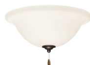
LED Light Fixture