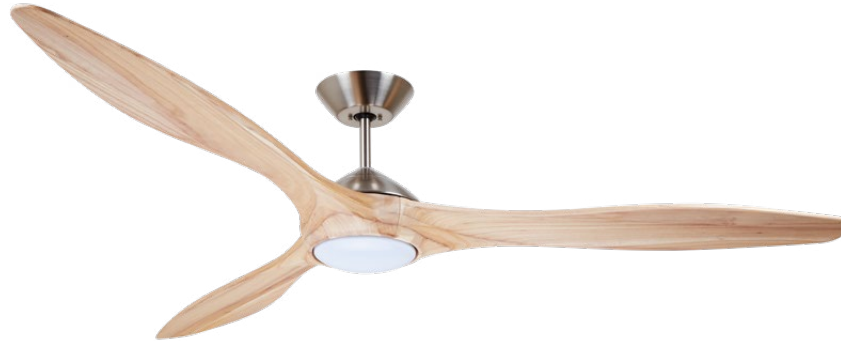
G. Shown in Brushed Steel with Sculpted Solid Wood Natural Blades and Opal Matte Shade

E. 72" LINDBERGH ECO – OIL RUBBED BRONZE CF315CO72ORB - Sculpted Solid Wood Coffee Blades, Opal Matte Shade