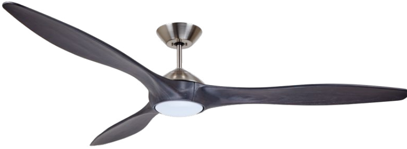
F. Shown in Brushed Steel with Sculpted Solid Wood Charcoal Blades and Opal Matte Shade