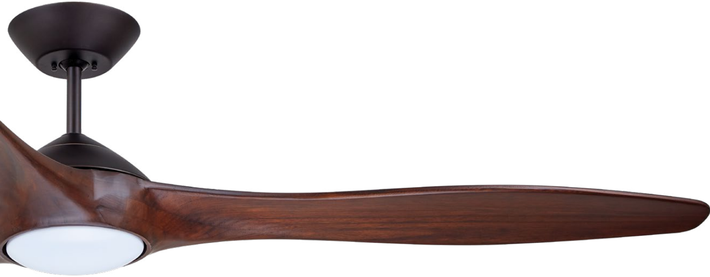
E. Shown in Oil Rubbed Bronze with Sculpted Solid Wood Coffee Blades and Opal Matte Shade