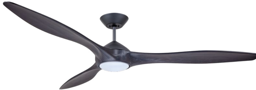
C. Shown in Graphite with Sculpted Solid Wood Charcoal Blades and Opal Matte Shade