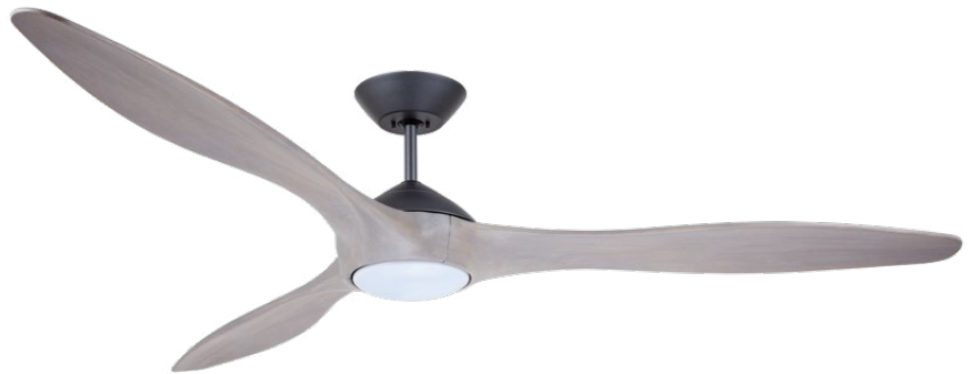
H. Shown in Graphite with Sculpted Solid Wood Timber Gray Blades and Opal Matte Shade

H. 72" LINDBERGH ECO – GRAPHITE CF315TM72GRT - Sculpted Solid Wood Timber Gray Blades, Opal Matte Shade