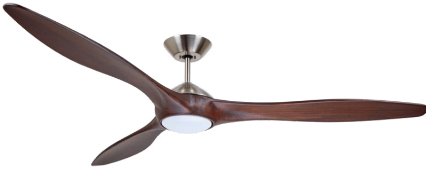
B. Shown in Brushed Steel with Sculpted Solid Wood Coffee Blades and Opal Matte Shade