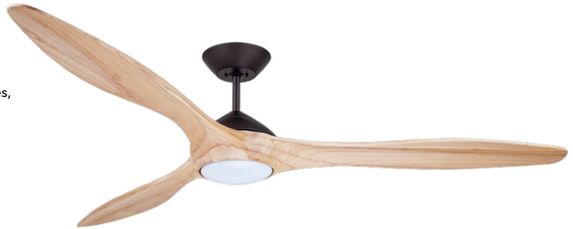
D. Shown in Oil Rubbed Bronze with Sculpted Solid Wood Natural Blades and Opal Matte Shade