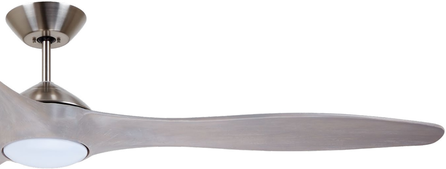
A. Shown in Brushed Steel with Sculpted Solid Wood Timber Gray Blades and Opal Matte Shade