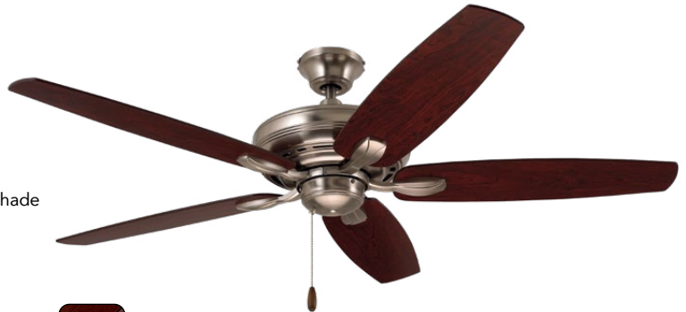
D. ASHLAND - BRUSHED STEEL CF717BS - Walnut/Dark Cherry Blades, Opal Matte Glass Shade