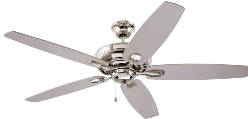
G. Shown in Polished Nickel with Light Gray Blades