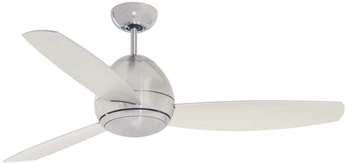
A. Shown in Brushed Steel with Brushed Steel Blades and No-Light Option

A. 52" CURVA™ LED – BRUSHED STEEL CF253LBS - Brushed Steel Blades, Opal Matte Glass Shade