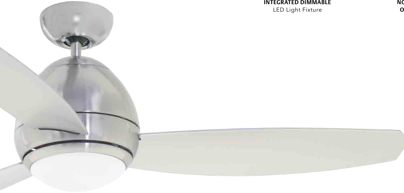
A. Shown in Brushed Steel with Brushed Steel Blades and Opal Matte Glass Shade