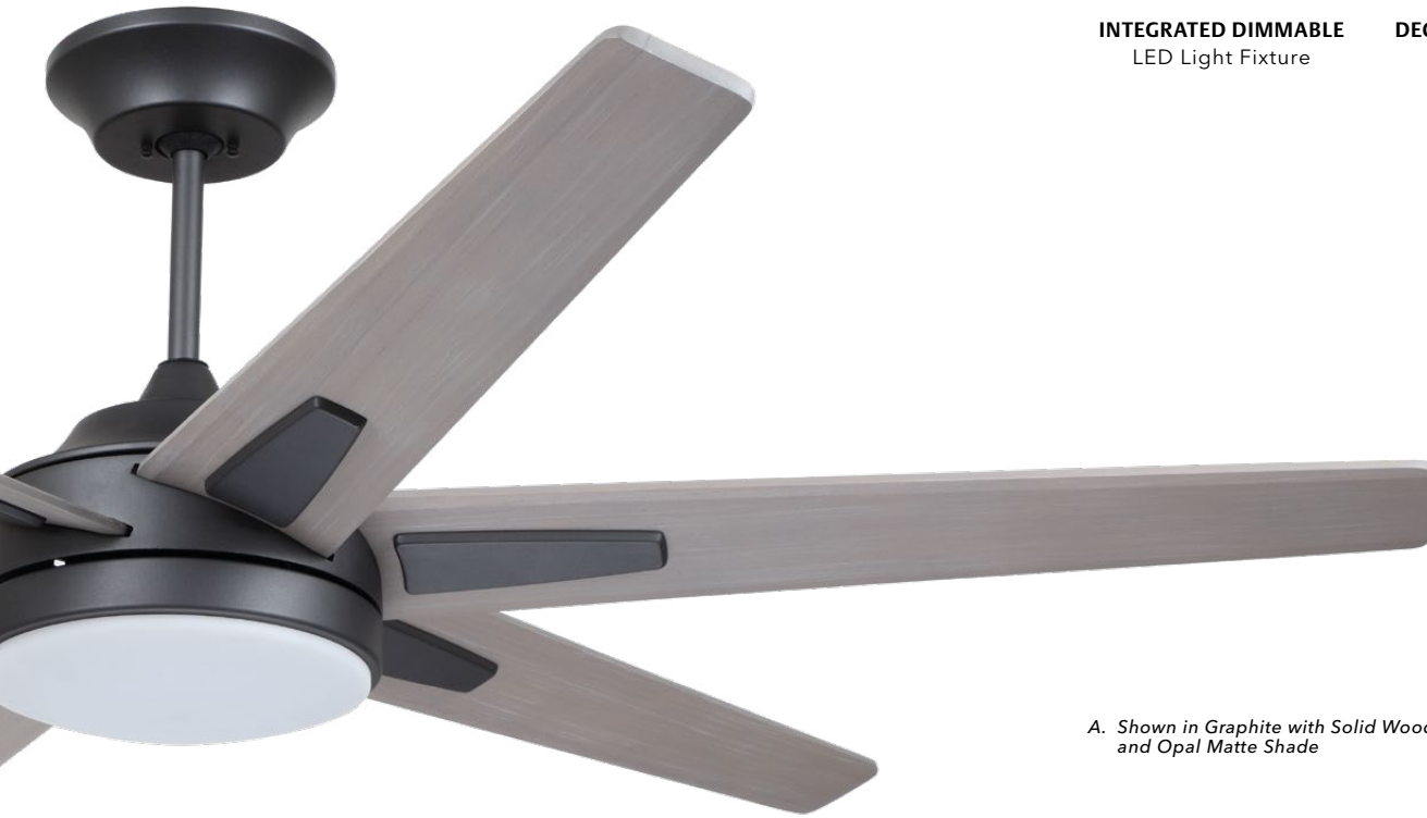
A. Shown in Graphite with Solid Wood Timber Gray Blades and Opal Matte Shade