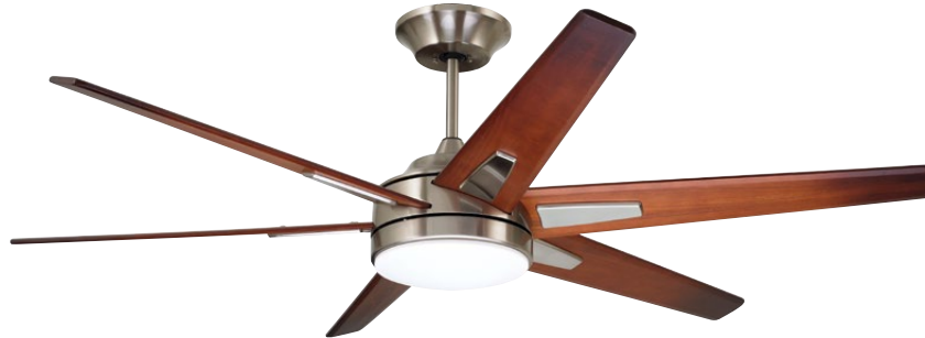
C. Shown in Brushed Steel with Solid Wood Sunburst Walnut Blades and Opal Matte Shade

A. 60" RAH ECO – GRAPHITE CF915TM60GRT - Solid Wood Timber Gray Blades, Opal Matte Shade