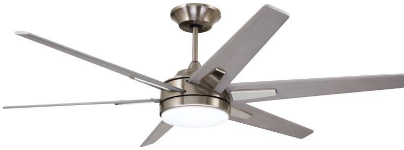
B. Shown in Brushed Steel Finish with Solid Wood Timber Gray Blades and Opal Matte Shade