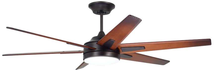
D. Shown in Oil Rubbed Bronze with Solid Wood Sunburst Walnut Blades and Opal Matte Shade

D. 60" RAH ECO – OIL RUBBED BRONZE CF915W60ORB - Solid Wood Sunburst Walnut Blades, Opal Matte Shade