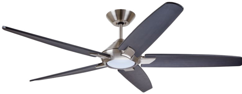
B. Shown in Brushed Steel with Curved Solid Wood Charcoal Blades and Opal Matte Shade