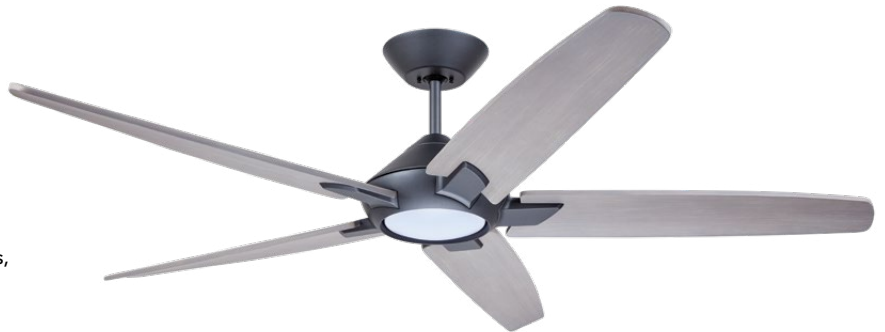
D. Shown in Graphite with Curved Solid Wood Timber Gray Blades and Opal Matte Shade