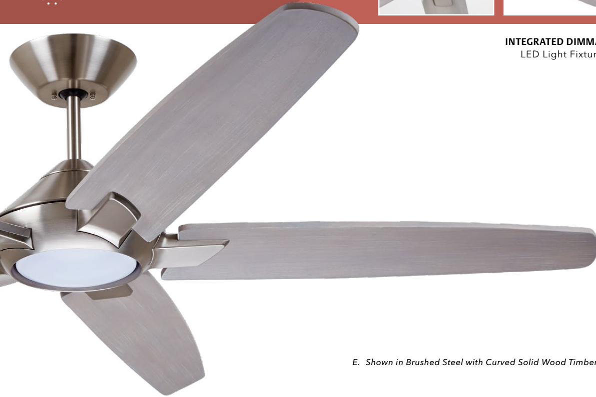
E. Shown in Brushed Steel with Curved Solid Wood Timber Gray Blades and Opal Matte Shade