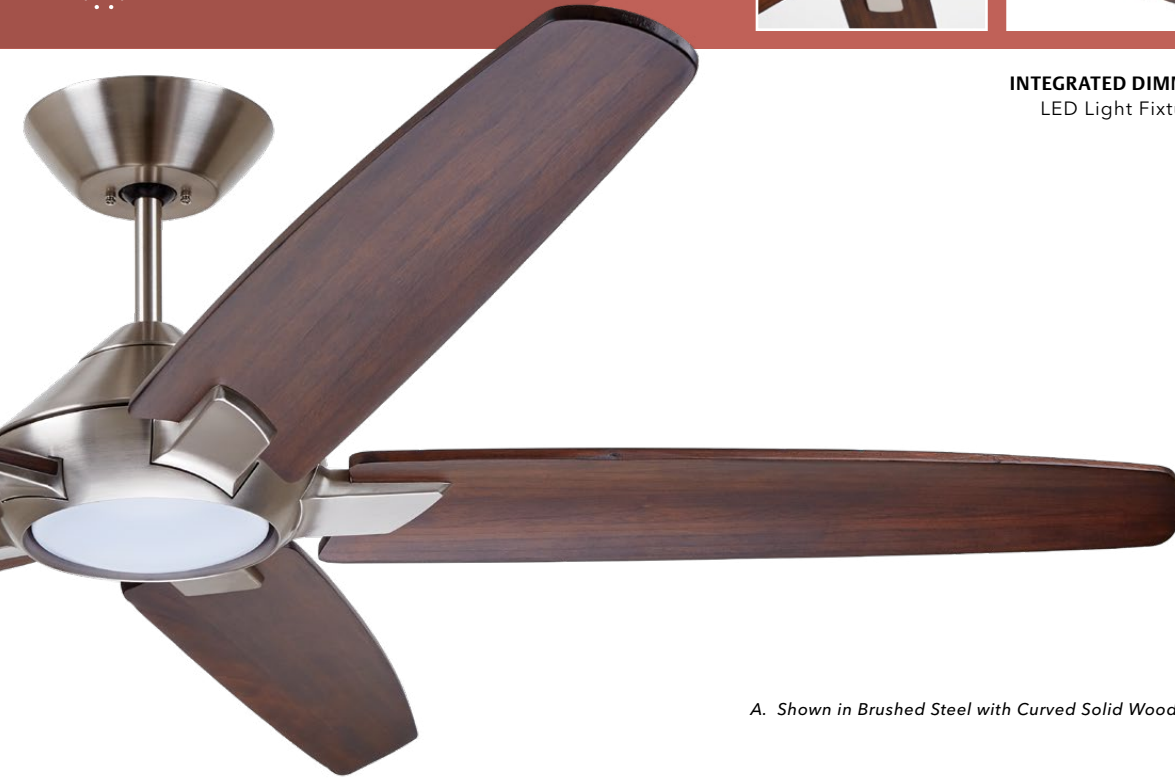
A. Shown in Brushed Steel with Curved Solid Wood Coffee Blades and Opal Matte Shade