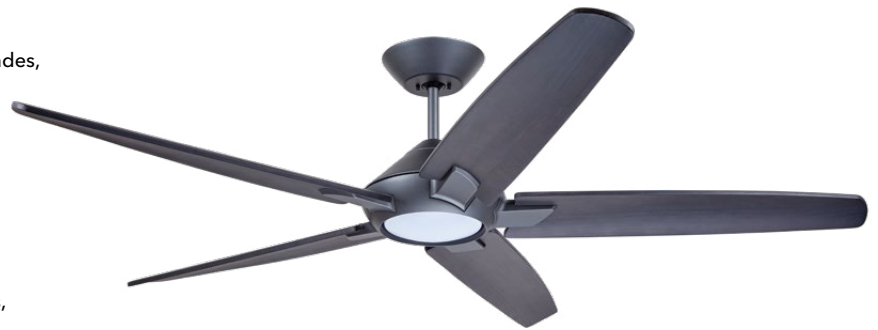
H. Shown in Graphite with Curved Solid Wood Charcoal Blades and Opal Matte Shade

H. 60" DORIAN ECO – GRAPHITE CF515CR60GRT - Curved Solid Wood Charcoal Blades, Opal Matte Shade