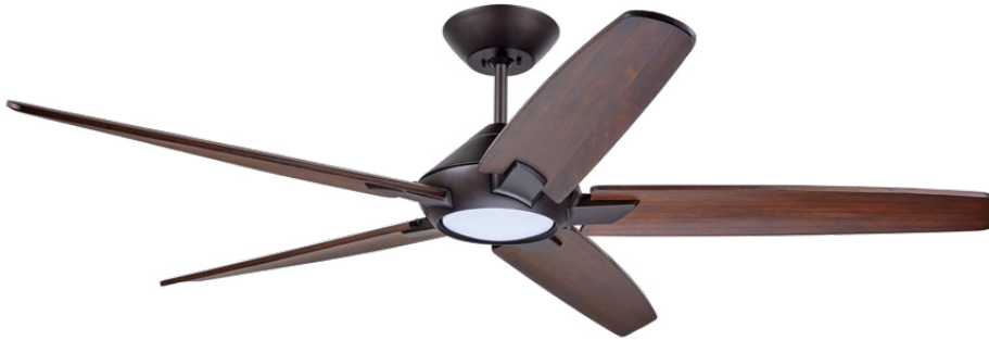
G. Shown in Oil Rubbed Bronze with Curved Solid Wood Coffee Blades and Opal Matte Shade

E. 60" DORIAN ECO – BRUSHED STEEL CF515TM60BS - Curved Solid Wood Timber Gray Blades, Opal Matte Shade