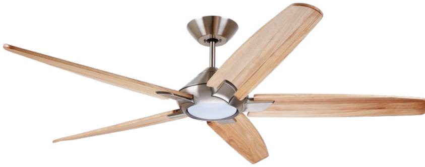
F. Shown in Brushed Steel with Curved Solid Wood Natural Blades and Opal Matte Shade