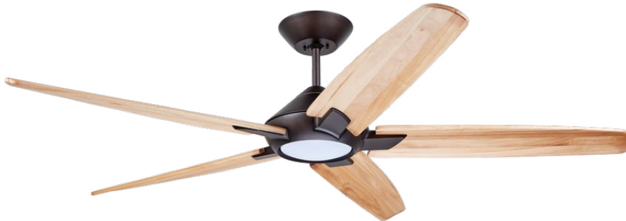
C. Shown in Oil Rubbed Bronze with Curved Solid Wood Natural Blades and Opal Matte Shade