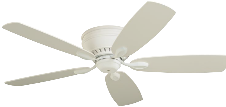
C. Shown in Satin White with Satin White Blades

A. PRIMA SNUGGER – BRUSHED STEEL CF905BS - Dark Cherry/Chocolate Blades