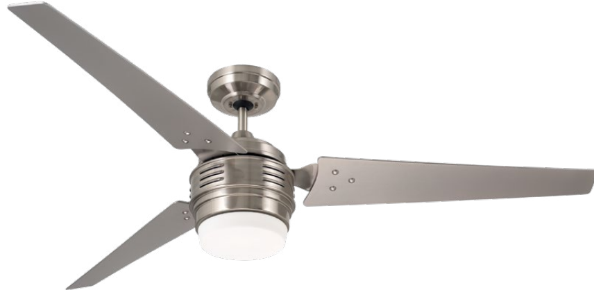
C. Shown in Brushed Steel with Brushed Steel Blades and Opal Matte Glass Shade