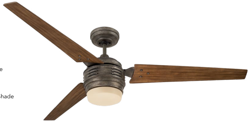
D. Shown in Vintage Steel with Riverwash Blades and Vintage Cream Glass Shade