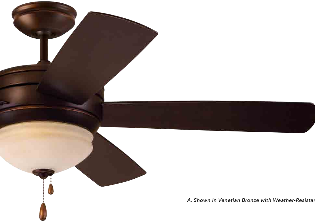
A. Shown in Venetian Bronze with Weather-Resistant Venetian Bronze Blades and Amber Mist Glass Shade