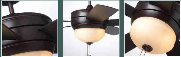
INTEGRATED LED Light Fixture