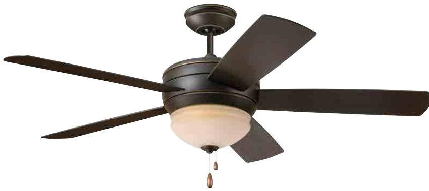
B. Shown in Golden Espresso with Weather-Resistant Golden Espresso Blades and Amber Mist Glass Shade