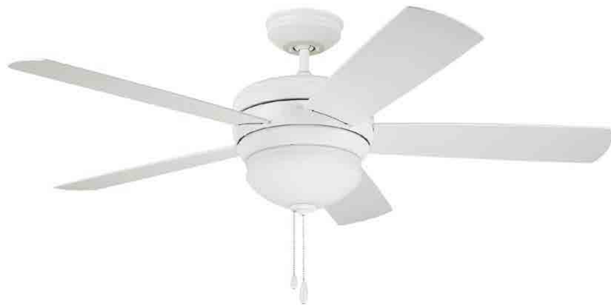
B. Shown in Satin White with Satin White Blades and Opal Matte Shade