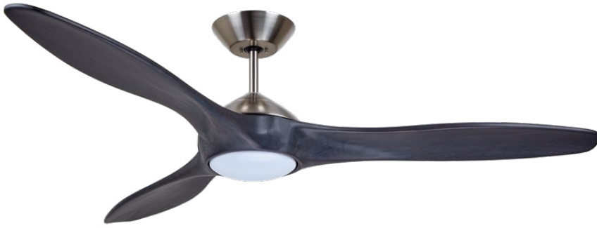
F. Shown in Brushed Steel with Sculpted Solid Wood Charcoal Blades and Opal Matte Shade