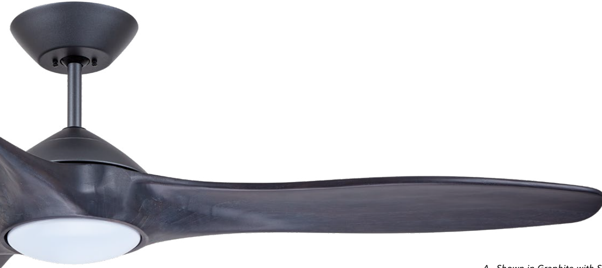
A. Shown in Graphite with Sculpted Solid Wood Charcoal Blades and Opal Matte Shade