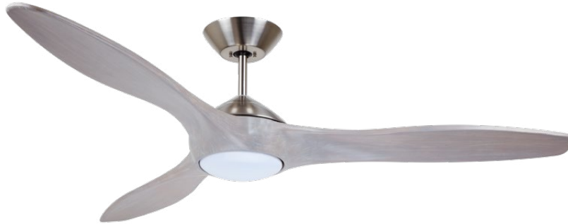
C. Shown in Brushed Steel with Sculpted Solid Wood Timber Gray Blades and Opal Matte Shade