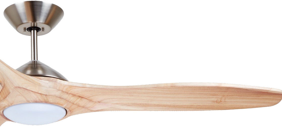
E. Shown in Brushed Steel with Sculpted Solid Wood Natural Blades and Opal Matte Shade