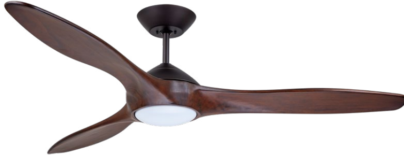
G. Shown in Oil Rubbed Bronze with Sculpted Solid Wood Coffee Blades and Opal Matte Shade

E. 60" LINDBERGH ECO – BRUSHED STEEL CF315NA60BS - Sculpted Solid Wood Natural Blades, Opal Matte Shade