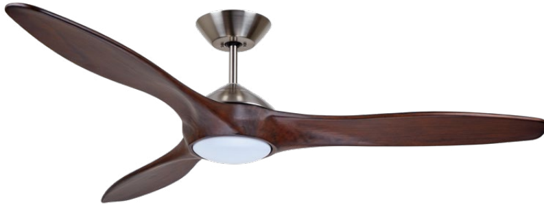
B. Shown in Brushed Steel with Sculpted Solid Wood Coffee Blades and Opal Matte Shade