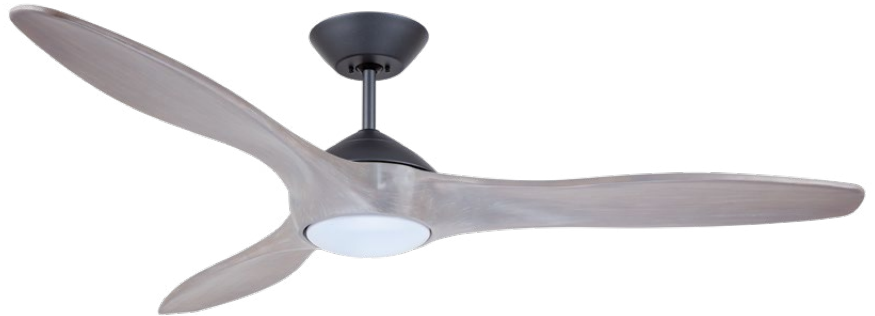
H. Shown in Graphite with Sculpted Solid Wood Timber Gray Blades and Opal Matte Shade

H. 60" LINDBERGH ECO – GRAPHITE CF315TM60GRT - Sculpted Solid Wood Timber Gray Blades, Opal Matte Shade