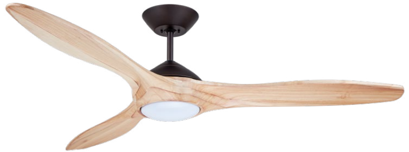
D. Shown in Oil Rubbed Bronze with Sculpted Solid Wood Natural Blades and Opal Matte Shade