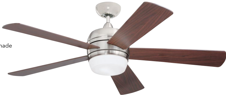
D. Shown in Brushed Steel with Dark Cherry Blades and Opal Matte Glass Shade