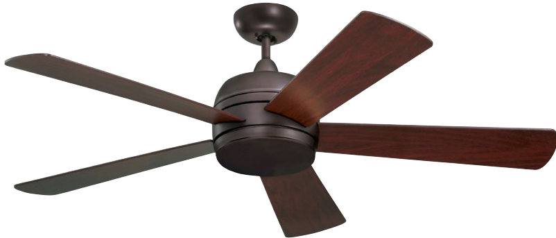
C. Shown in Oil Rubbed Bronze with Mahogany Blades and No-Light Plate (CP930ORB)