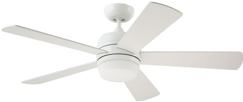
B. Shown in Appliance White with Appliance White Blades and Opal Matte Glass Shade