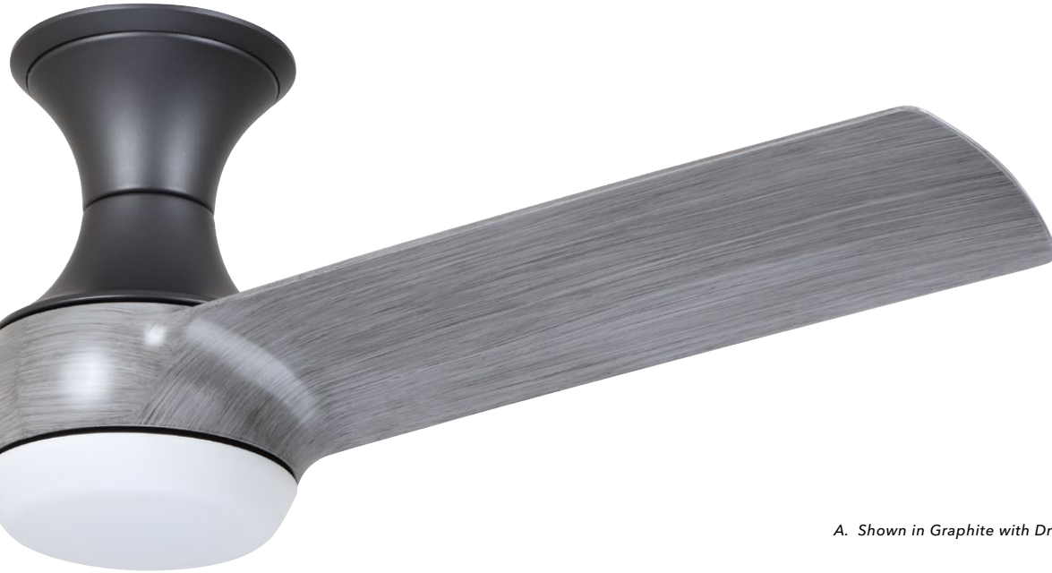
A. Shown in Graphite with Driftwood Blades and Opal Matte Shade