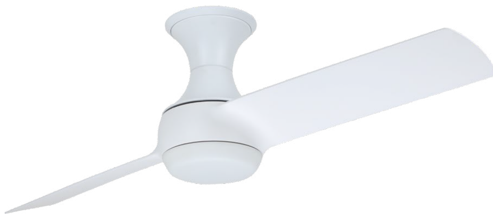
C. Shown in Satin White with Satin White Blades and Opal Matte Shade