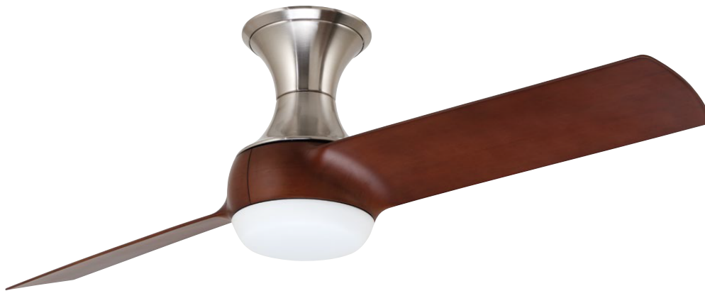
B. Shown in Brushed Steel with Walnut Blades and Opal Matte Shade