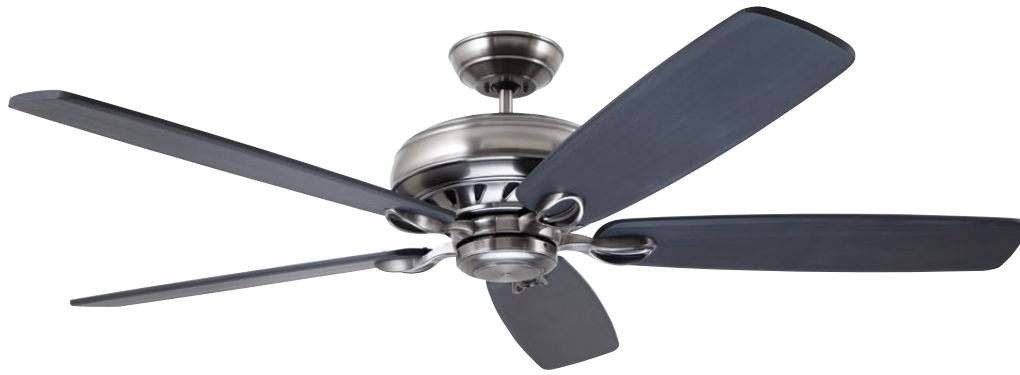
B. Shown in Antique Pewter with 22" Charcoal Blades (B78CR)