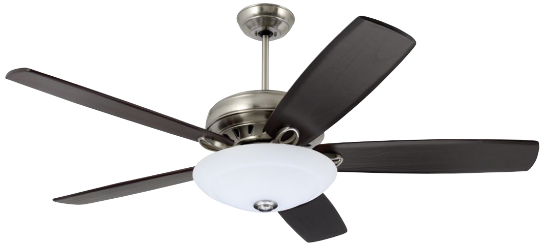
F. Shown in Brushed Steel with 25" Solid Wood Dark Mahogany Blades (B78DM) and Riley Light Fixture (LK180BS)