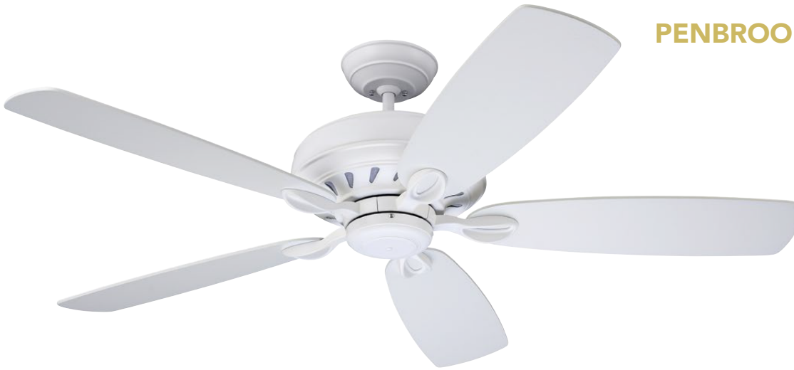
E. Shown in Satin White with 22" Satin White Blades (B77SW)