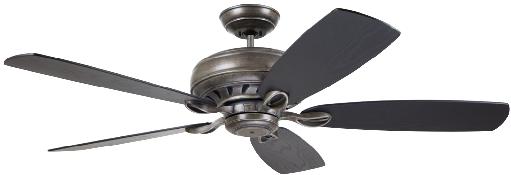
C. Shown in Vintage Steel with 25" Black Blades (B78BK)