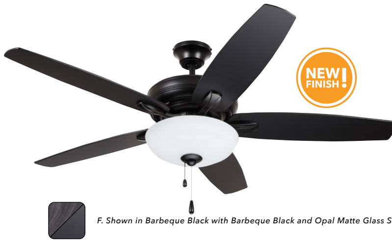
F. Shown in Barbeque Black with Barbeque Black and Opal Matte Glass Shade

kathy ireland ® HOME by LUMINANCEBRANDS ™