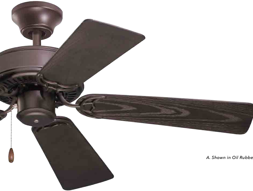
A. Shown in Oil Rubbed Bronze with Weather-Resistant Oil Rubbed Bronze Blades