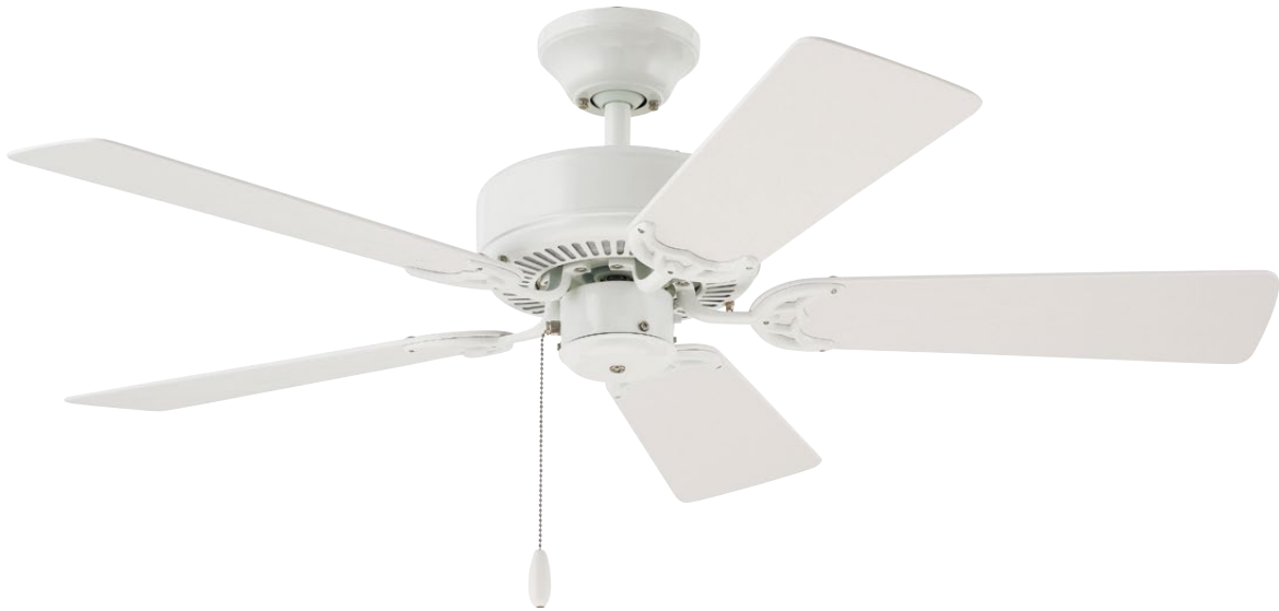
A. Shown in Appliance White with Weather-Resistant Appliance White Blades