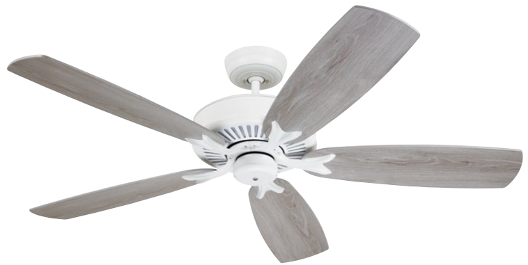
D. Shown in Satin White with Timber Gray Blades (G54TM)

SHIPPING SPECIFICATIONS: Carton Weight: 18.60 LBS | Length: 14.50" | Width: 14.50" | Depth: 13.25"