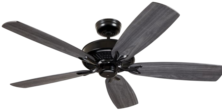
B. Shown in Barbeque Black with Charcoal Blades (G54CR)