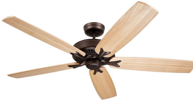
C. Shown in Oil Rubbed Bronze with Solid Wood Natural Blades (G78NA)