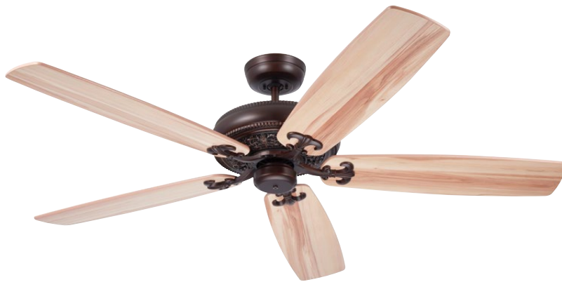
C. Shown in Venetian Bronze with Natural Blades (G60NA)