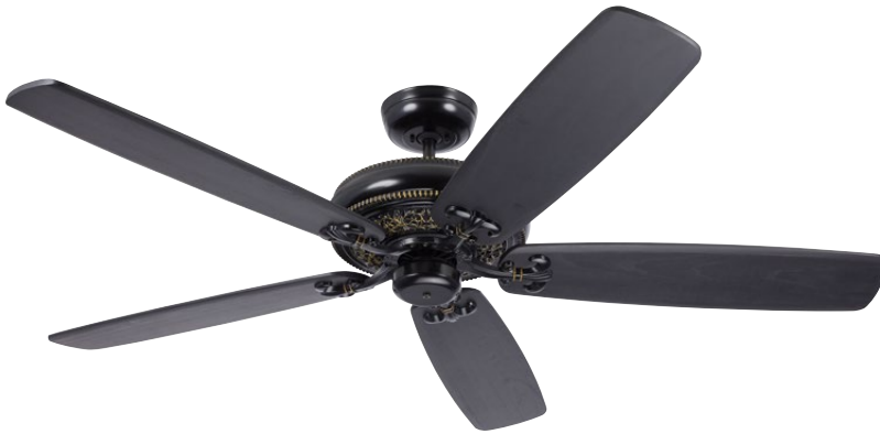
B. Shown in Barbeque Black with Black Blades (B78BK)